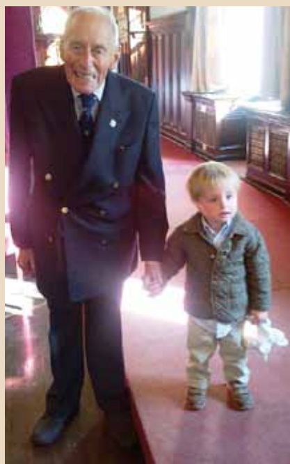
The youngest and most senior Masons.