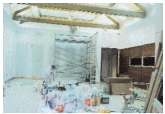
Final painter work underway in the old top floor schoolroom

Full details of the completed Hall and all its revitalised facilities will be included in the next issue of the Craftsman.