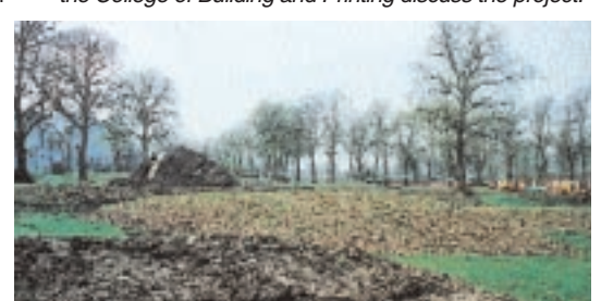
The site at the House for an Art Lover as it is at