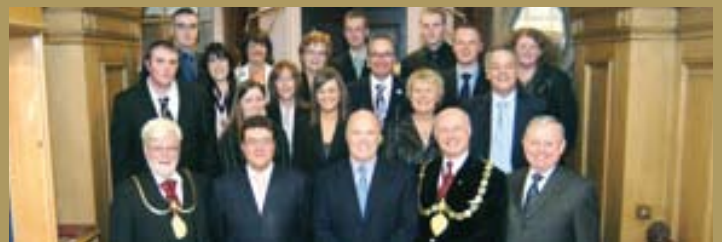
Judges, sponsors and winners at the awards dinner