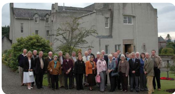
Members of Trades House, friends and family, visited The Hill House, Helensburgh, for a tour of the house and garden followed by lunch at The Royal Northern Yacht Club in Rhu. The outing, hosted by the Trades House Lodge, was greatly enjoyed by all.