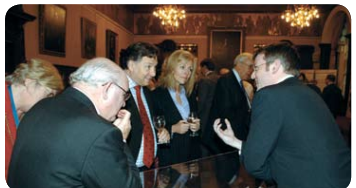
The Banqueting Hall proved the perfect venue to display a selection of the John Murray Archive.