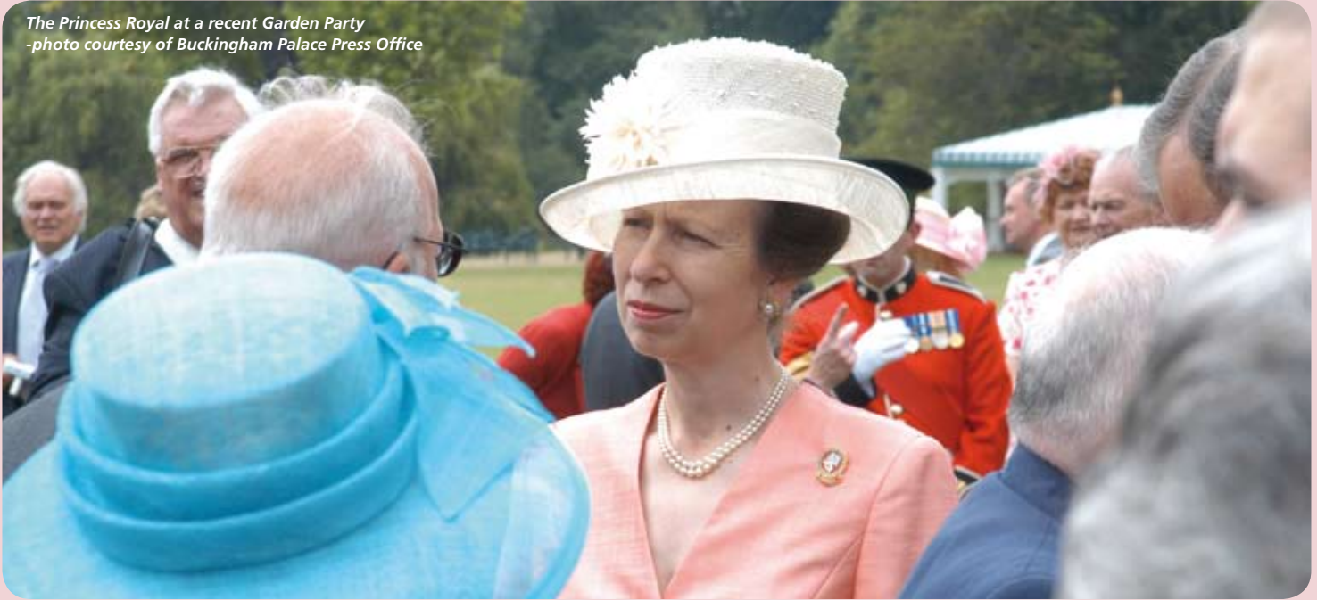
The Princess Royal at a recent Garden Party

HRH The Princess Royal will present the awards at this year's Trades House of Glasgow Modern Apprentice of the Year Award celebration dinner, which takes place in the Trades Hall on Wednesday 5 March.