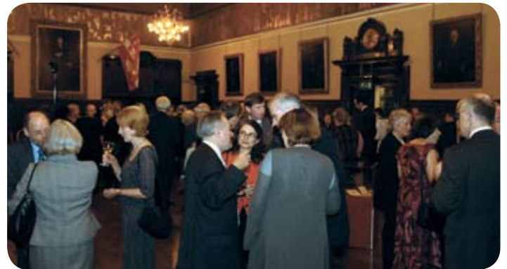
Guests gathered to hear more about the John Murray Archive.

The NLS Trustees were very appreciative of the facilities provided and pleased to have the opportunity to exhibit items from the John Murray Archive in the magnificent setting of the Trades Hall.