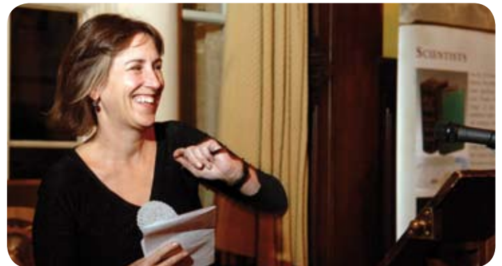
Television journalist Kirsty Wark gave an engaging address to the audience about the fantastic John Murray Archive, and how thrilled she is that it has come to Scotland.