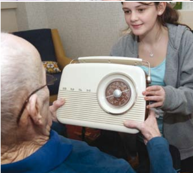
One of the tools used by staff in Reminiscence Therapy