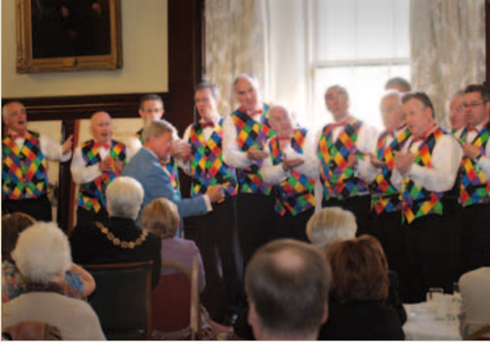
Close Shave entertain the beneficiaries.