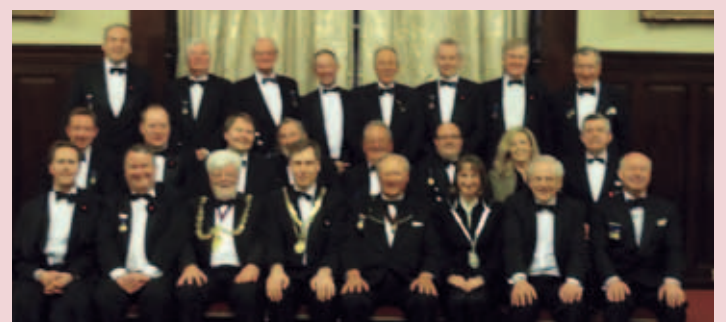
Members of the Craft at their successful Box Opening Dinner in the Trades Hall.