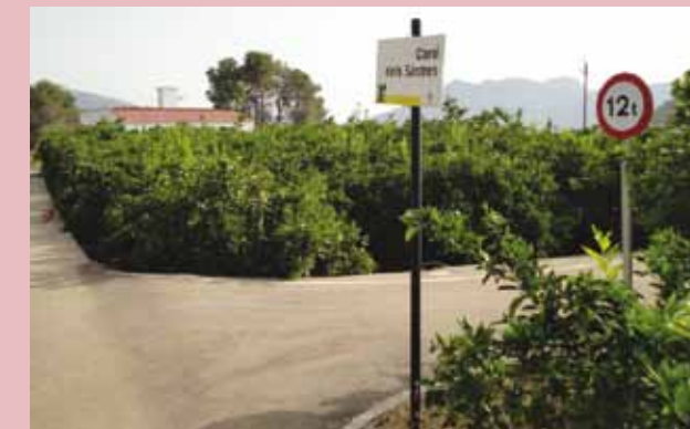
The Tailor Street sign in Spain

Thanks to the support from the Tailors, the Society has been able to bring forward its planned activities for Scotland. It hopes for even more support from the Tailors during 2011, when major campaigns will focus on whales, dolphins, seals and sharks, while onshore activities will focus on the development of outreach and education programmes, especially in Glasgow and Scotland. More information on Sea Shepherd can be found at www.seashepherd.org/uk .