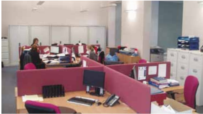
The new office suite

Following major refurbishment of the former caretaker's flat located within the Trades Hall, the Trades House of Glasgow administration team have moved from the North Gallery to take up residence in this newly created office suite.