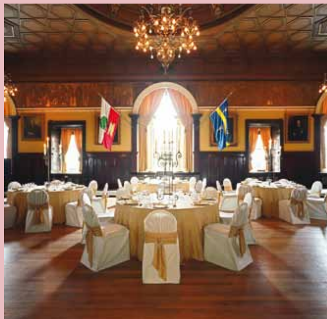
The Grand Hall

If you would like to book a social or business event or find out more about the Trades Hall of Glasgow function rooms, please contact the administration team as detailed under Diary Dates 2011. You can also find out more about the Trades Hall at www.tradeshallglasgow.co.uk