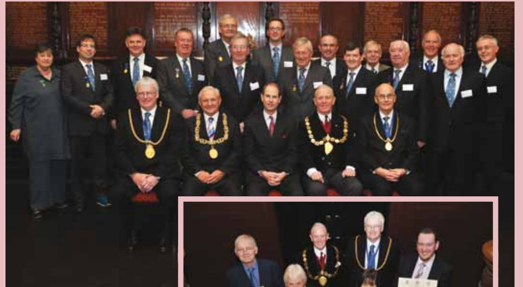
The Incorporation of Coopers Master Court with HRH The Earl of Wessex, the Lord Provost and the Deacon Convener