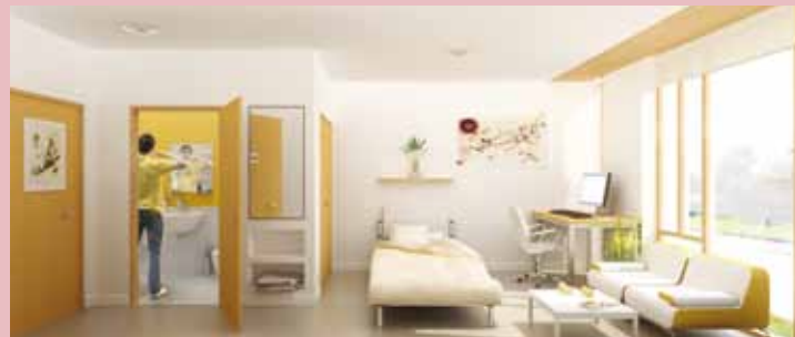
The Glasgow Ball will raise funds for the Scottish Epilepsy Centre

- considerable resources are also devoted to general benevolent work. Donations of more than £400,000 are awarded each year to deserving causes and individuals across the city of Glasgow.