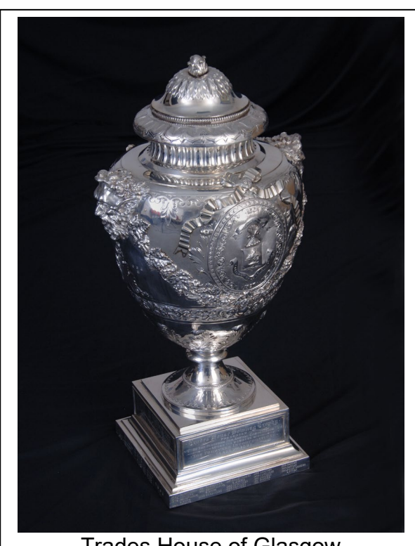
Trades House of Glasgow Bowling Trophy Presented 1897

http://www.tradeshouselibrary.org/uploads/4/7/7/2/47723681/criminal_reports_in_glasgow ~ final_small.pdf