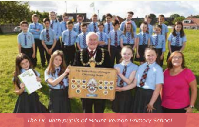
The DC with pupils of Mount Vernon Primary School