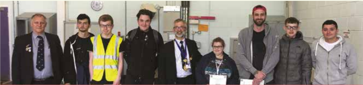
The Late Collector and Deacon at the Pre-Apprentice Competition

This year it was the turn of the Masons to design a window for the link corridor of the Royal Infirmary, crafted by students at City of Glasgow College. This magnificent piece features old and modern themes and we encourage you to see it soon.