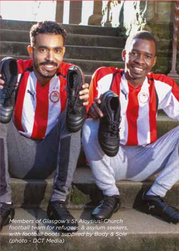
Members of Glasgow's St Aloysius' Church football team for refugees & asylum seekers, with football boots supplied by Body & Sole

Fund raising was also assisted by a very well attended Choosing Dinner and Box Opening Supper and the recruitment of new members to the Craft.