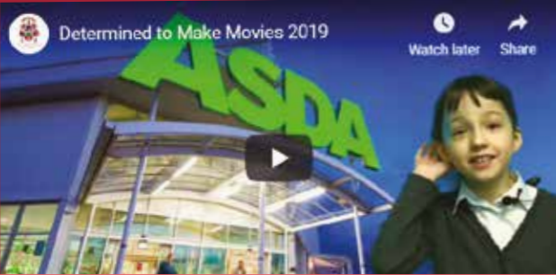
The award winning DTMM entry