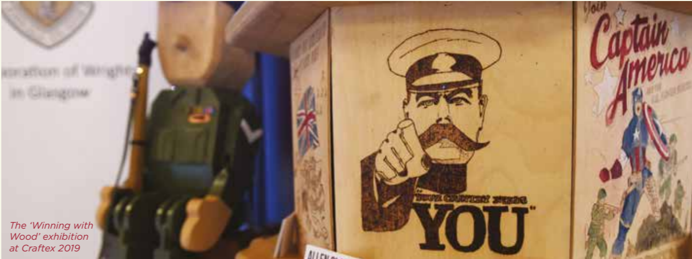
The 'Winning with Wood' exhibition at Craftex 2019

Several new members are in process of joining the Craft and members participated fully in the life of Trades House.