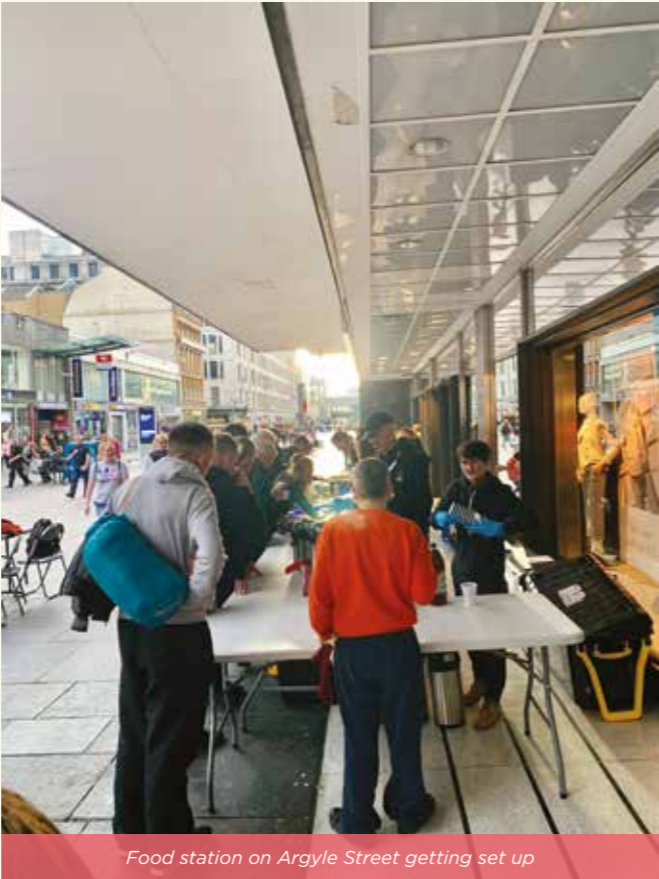
Food station on Argyle Street getting set up