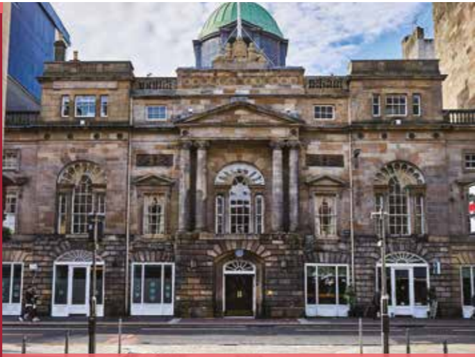
Trades Hall of Glasgow

We mark the end of another busy year for Trades House and the 14 Incorporated Crafts with this edition of the Craftsman, which we hope gives a feel for the range of work we do, the people we help and the history and heritage of the organisation.