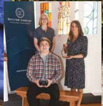
Winners of Craftex 2019