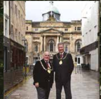
The new Deacon Convener & Collector