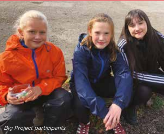
Big Project participants

This is phase 1 of the Big Project. Trades House has so far donated £30,000 to fund it and hopes to give additional money to enable new groups of children to enjoy similar experiences in 2020.