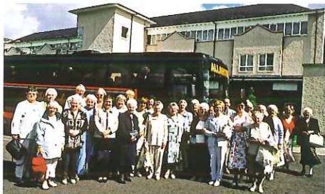
All on board for summer in St Andrews

Lunch and high tea at the Old Course Hotel in St Andrews were on the menu for 150 beneficiaries enjoying this year's Incorporation of Hammermen Service Group summer outing. Everyone was given a few hours to take in the town in what was a fabulous day trip.