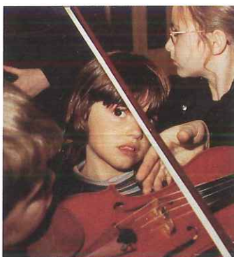
Did someone stand on the cat?