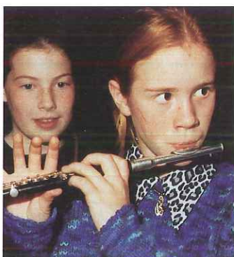
Eat your heart out Gazza!