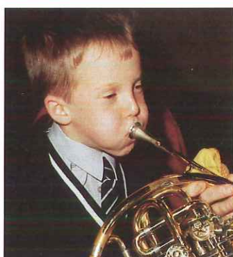
How hard do I have to blow?