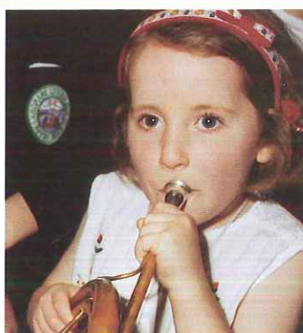
Can I play "Flower of Scotland"?