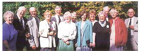
The "Gang" pictured here are still supporting House activities and have raised £150 for the Trades Hall Renovation Appeal