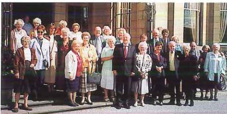
Guests arrive at the Gleneagles Hotel

The annual panto outing was held in January with 130 guests attending a performance of "Sleeping Beauty" at the King's Theatre with a buffet meal at the RSAC.