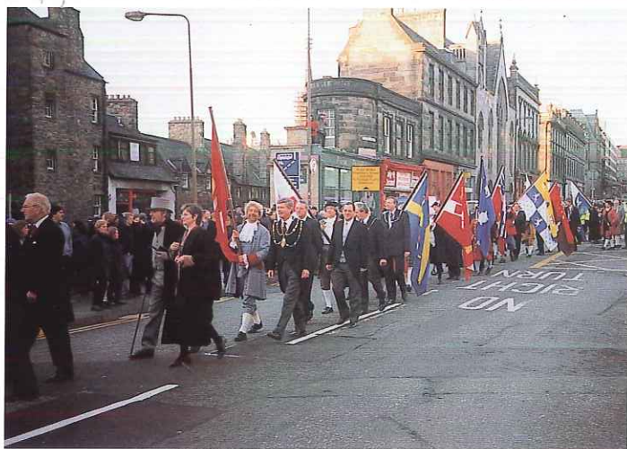
The Trades House Incorporations "brighten up" Edinburgh

The year 2000 can be used for enhancing all House efforts, and the Millennium Committee will be pleased to assist in any way possible.