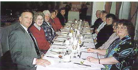
All set for the "spread" at the RSAC