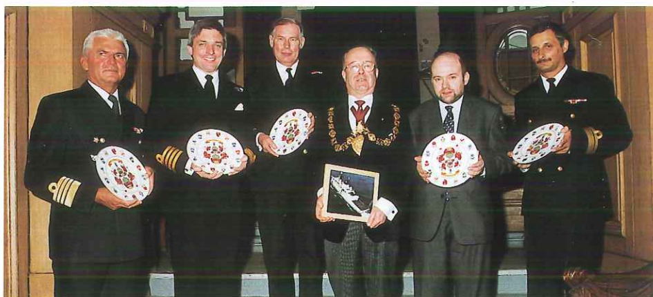
H.M.S. Coventry, and a heraldic plaque from O.R.P. Wodnik.