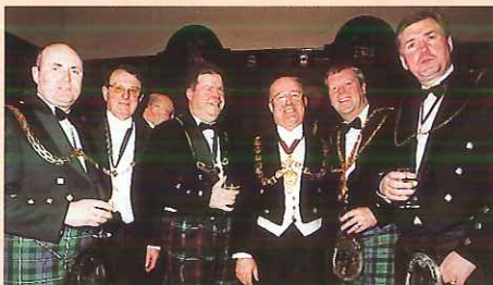
The Deacon Convener with some members of his charity fund raising Chain Gang

tapped and I have made an effort to set up a Deacon Convener's Task Force to assist with existing projects and encourage new ideas such as the proposed musical association which latter I hope will be a forum for fellowship and good entertainment among members of the House and their friends.