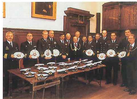
Plenty of "scrambled eggs" on display as the Deacon Convener presents commemorative Trades House plates to the Senior Officers and Ships' Commanders attending