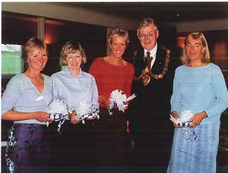
The Coopers second place team with the Deacon Convener