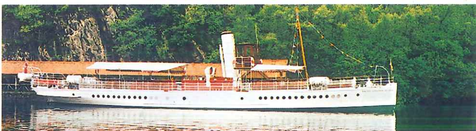
The Sir Walter Scott on Loch Katrine

Within the next few weeks the site will achieve its purpose as a useful communication medium. The scope of information available on the web-