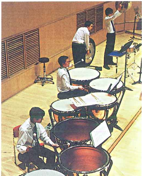
Students of the National Youth Orchestra of Scotland are happy to have "drummed up" support from the Commonweal Fund

The Commonweal Committee also administers a number of Trusts, Funds and Bequests and a total of some £8000 was distributed in accordance with the wishes of the benefactors.