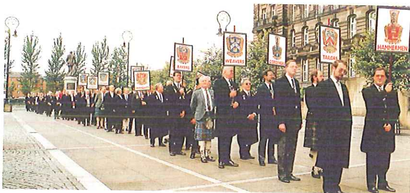
The craftsmen of to-day with their coats of arms

Later in the day at the Trades Hall honorary membership of various crafts was conferred on five distinguished recipients, namely:-