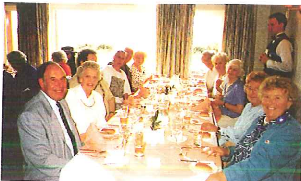
Guests enjoying lunch at Troon