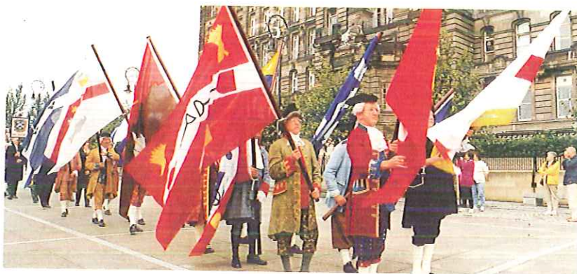
Craftsmen of yesteryear in the spirit of the day