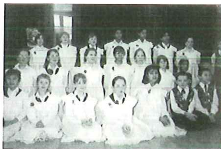
The choir singing one of their quieter numbers