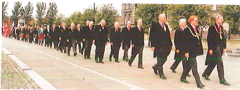
Members of the Platform lead the way