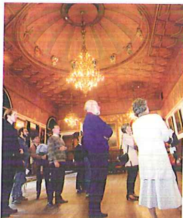
Visitors are shown the Banqueting Hall which will be upgraded in the next phase

In September thousands of people were able to see the new look hall during the 200th anniversary celebrations, the crafts' annual Deacons' election meetings and at two public open days.