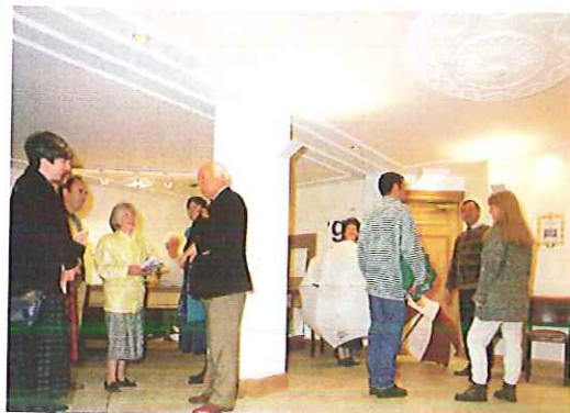
Visitors tour the new reception area during Doors Open Day